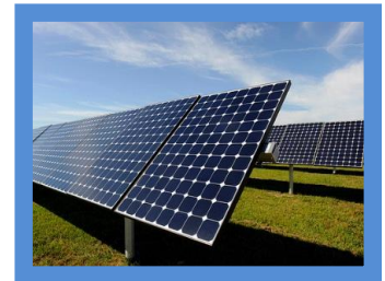
DeSoto Next Generation Solar Energy Center

Developer: MMA Renewable Ventures Electricity Purchaser: Nellis AFB Location: Clark County, NV Technology: PV Capacity: 14 MW