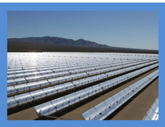
Nevada Solar One

Developer: Acciona Electricity Purchaser: NV Energy Location: Boulder City, NV Technology: Trough Capacity: 64 MW Source: Acciona North America