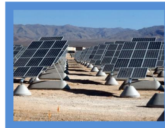
Nellis Air Force Base

Developer: eSolar Electricity Purchaser: Southern California Edison Location: Antelope Valley, CA Technology: Tower Capacity: 5 MW